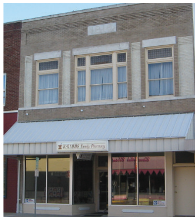
Kribbs Family Pharmacy - 2010